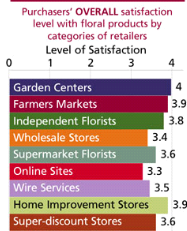
The type of retail outlet consumers are visiting to purchase houseplants—and how satisfied they are with the plants from these outlets. When ranking from 0 (Extremely Unsatisfied) to 5 (Extremely Satisfied), the average overall satisfaction level for Garden Centers is 4.0. The remaining retailer scores followed closely between 3.0 to 3.9 out of 5.0 in overall satisfaction of products and services offered.