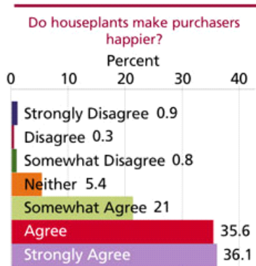
This chart reveals the grand truth of the study: Houseplants make people feel happier—36% of purchasers strongly agreed that houseplants made them feel happier. Another 36% agreed that houseplants made them feel happier; 21% somewhat agreed; 2% disagreed that houseplants made them feel happier.

you in your product experience campaign,” he added. Container texture, material, sustainability and brand were relatively less important to consumers.