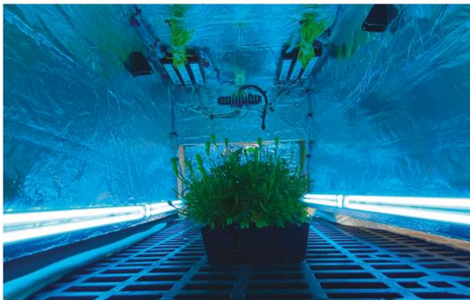
UV-C light applied from the side can kill thrips on the underside of leaves without any significant plant damage.

control when implemented early in the season. As guardian plants, marigolds attract thrips away from the main crops. Once on the marigolds, thrips can be targeted by predatory mites and Beauveria bassiana , an insect-killing fungus mixed in the soil.