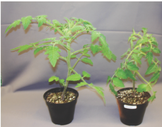
Figure 1. Tomatoes are a good indicator plant because they exhibit epinasty (downward bending of the leaves) when exposed to ethylene (plant on the right). They can be placed in the greenhouse near heaters and other equipment that might produce ethylene in the greenhouse.