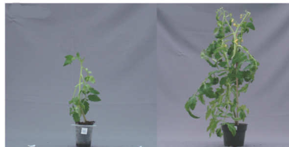
Figure 3. Effect of plant age or maturity on ethylene sensitivity. Leaf epinasty was determined at 0 days in mature flowering plants that were 8 to 9 weeks old and immature plants that had no flowers and were 4 to 5 weeks old. Bars represent the average change in the leaf angle and error bars represent the SE. Bars with different letters are significantly different.