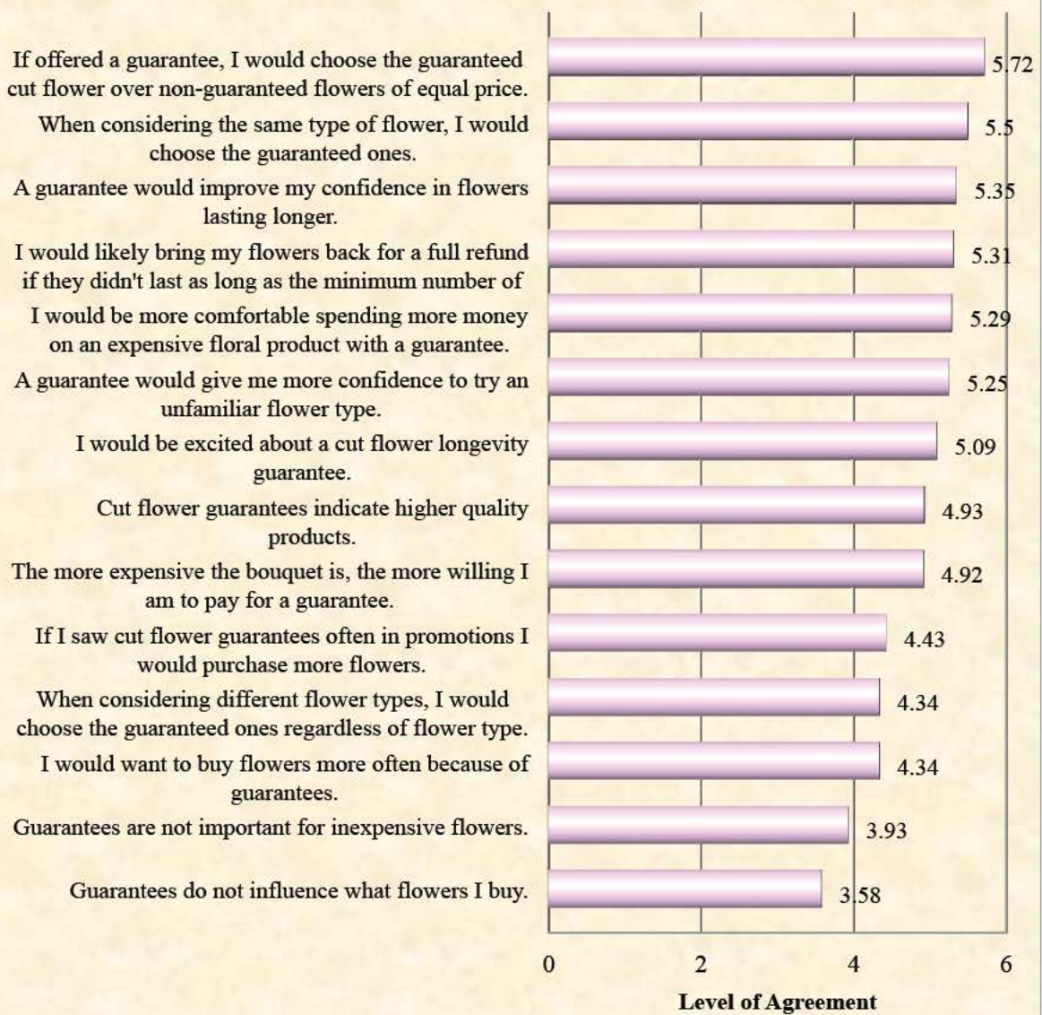
Figure 1. Participants' opinions about cut flower longevity guarantees (1=strongly disagree, 7=strongly agree)

Communication Methods: Even though participants liked the idea of cut flower guarantees, businesses need to find ways to clearly communicate the guarantees. Participants felt the best way of communicating a guarantee to consumers is with labels on the package of flowers (42%), followed by in-store signs/displays AND package labels (32%), and in-store signs/displays (14%) (Figure 2). Less desirable options included verbal reminders (6%), e-mails/online reminders (4%), and advertising (1%). Similar to longevity labels, in-store reminders were the most popular options for communicating cut flower guarantees whereas verbal reminders, e-mails/online reminders and advertising are easier to forget. Focus group participants supported these findings and they felt that being informed at the point of purchase was the best method. Additionally, individual labels on flower packages would clearly communicate differences between flowers and assist customers in making the best and most informed