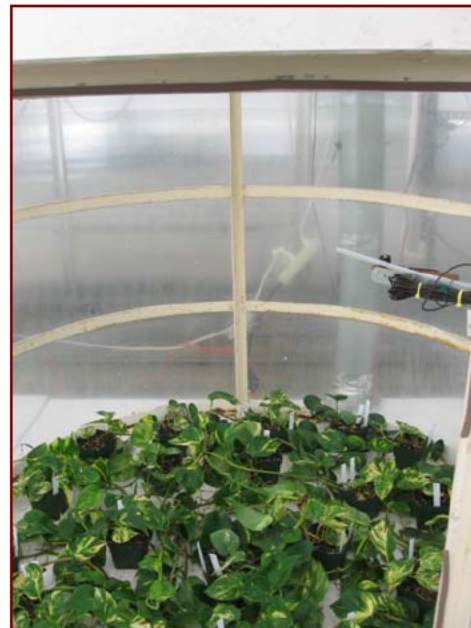
Figure 2. Pepper-face in the CSTR Chamber.

May 2010 – Copyright American Floral Endowment All Rights Reserved