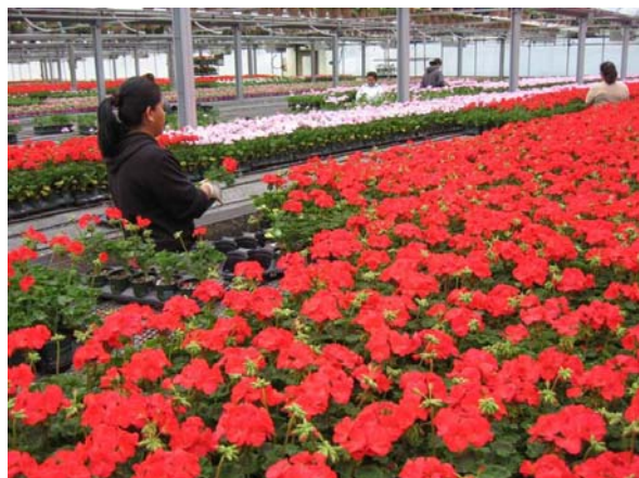
Figure 3. Currently, greenhouse growers manually remove lower leaves that have turned yellow or brown during production of potted geranium. This project has identified a way to reduce lower leaf loss of geranium, which can save labor and increase the aesthetic quality of plants.

We have identified how BA±GA can be applied by greenhouse growers to improve the postharvest performance of potted flowering crops, including geranium and poinsettia. This information can be used by greenhouse growers