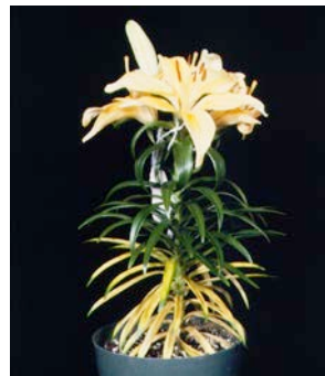
Storage causes leaf yellowing.

The major problem with storing lilies is the manifestation of leaf disorders. The extent of leaf damage and the type of leaf disorder varies with cultivar and storage time. Disorders include leaf yellowing, leaf scorch, and leaf abscission.