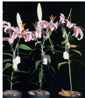
Leaf abscission occurred after 9 days of storage at 35°F.

Generally, these symptoms occurred quickly after storage. The extent of damage increased with storage time.