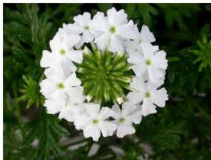
Fig. 1. Verbena cultivar Babylon White.