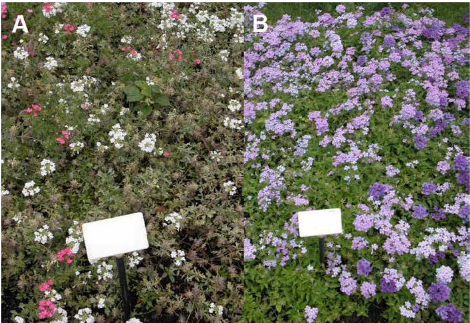
Fig. 3. A, ‘Babylon White’ (high susceptibility) and B, ‘Superbena Large Lilac Blue’ (low susceptibility) grown in an outdoor planting. Note browning and dying foliage of ‘Babylon White’ due to powdery mildew infection.

The wide variation in verbena susceptibility to powdery mildew is good news: growers can choose to grow cultivars that are less prone to disease. Those cultivars that were intermediate in their susceptibility or that were tested only once will be re-tested over the next few years. Growers who produce any of the cultivars on the “high susceptibility” list should scout especially carefully for the first signs of powdery mildew, turning over lower leaves to check for hidden colonies of the fungus. Fungicide