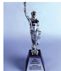
2014 MarCom Platinum Award, AFE's fourth accolade for the "Murder, Sex and Greed" video.