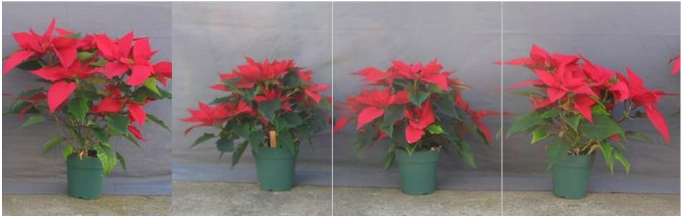
Figure 5. Representative plants poinsettias Cv. Classic Red from the various treatments. From left to right: control plants without any height control, plants drenched with PGRs, plants sprayed with PGRs, and plants exposed to controlled water deficit. Only plants exposed to controlled water deficits had a final height within the 16 – 18” target range.

deficit on the plants. PGR treatments reduced height more than desired. In addition, the PGR spray reduced bract size and, thus, plant quality.