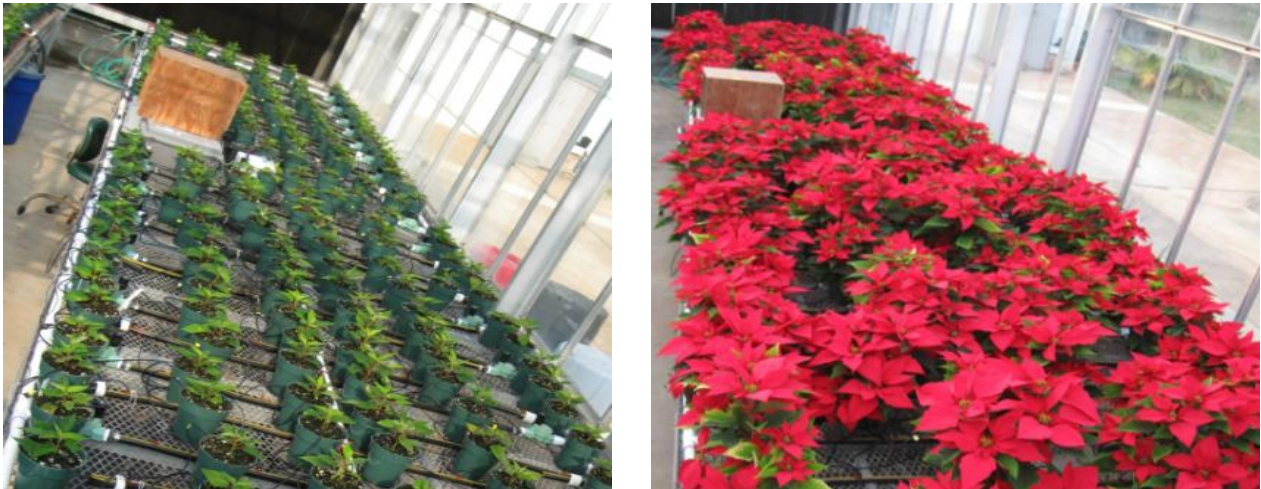
Figure 1. Overview of the study near the beginning (top) and end of the study.

In general, plant height control is a critical issue with floricultural crops. With potted poinsettia production, it is very important. Sale contracts for poinsettias commonly include plant height specifications and growers must produce plants that fall within a specified height range. The most common method to control plant height is through the application of plant growth retardants (PGRs). PGRs can be applied as a spray or drench, but their efficacy is not always predictable. Some PGR applications to poinsettia can result in excessive stunting and decreased bract size; thus, reducing plant quality.