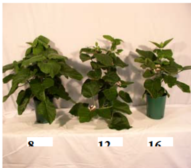
Figure 3. Effect of daily photoperiods of 8, 12, or 16 hours on growth and flowering of C. phillippinum .

After 61 d in the photoperiod treatments, C. phillippinum flowered an average of 39 d in the 12 h treatment, and an average of 17 d in the 16 h treatment. There were no flowers in the 8 h treatment. For the 8 h photoperiod, days to flower, height and number of inflorescences were different from the 12 and 16 h photoperiod. Therefore, this species was determined to be a long day plant (Figure 3).