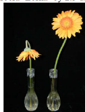
Control ClO 2