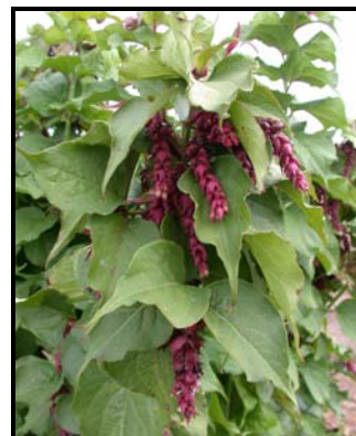
Photo 1. Leycesteria inflorescences are more visible when most of the foliage is removed.

Vase life was 11-13 days regardless of treatment. Significant spider mite damage made it unclear whether vase life decline was due to the spider mites or natural decline. Minimum vase life was 9 days.