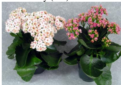
Photo 2. Ethylene response was immediate for Dark Pink calendiva (right), while it took several days for symptoms on White with Pink variety (left).

Dark Pink, Charm Red, and Red the floret petals folded inward and closed within 2-3 hours after removal from ethylene. For the White and White with Pink varieties, the damage was delayed for 5-7 days and the flowers died prematurely.