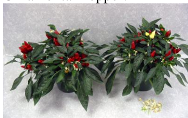
No ethylene Ethylene

Photo 3. Short-term (24 hrs) ethylene exposure induced only flower drop (right) on Ornamental Pepper.