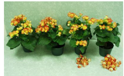
Photo 1. Elatior Begonia 'Carnival' treated with EthylBloc® and then exposed to 1 ppm ethylene for 24 hrs. Duration (from left to right) 4, 7, 10 and 13 days later.

EthylBloc® was very effective in protecting plants from ethylene. When exposed to 1 ppm ethylene for 24 hours after treatment, the protection lasted from 7-10 days. When plants were exposed to continuous 1 ppm ethylene, EthylBloc® was effective for 4 days.