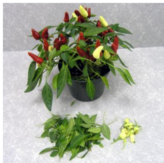
Photo 4. Exposure to ethylene for 48 hours induced flower, leaf and fruit drop on Ornamental Pepper.

With exposure times of 48 and 72 hours, flower, leaf and fruit drop occurred. The longer the exposure time the more extensive the damage.