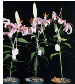
Leaf abscission occurred after 9 days of storage at 35°F.

Generally, these symptoms occurred quickly after storage. The extent of damage increased with storage time.