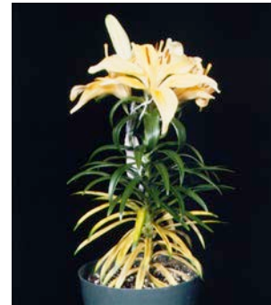
Storage causes leaf yellowing.

The major problem with storing lilies is the manifestation of leaf disorders. The extent of leaf damage and the type of leaf disorder varies with cultivar and storage time. Disorders include leaf yellowing, leaf scorch, and leaf abscission.