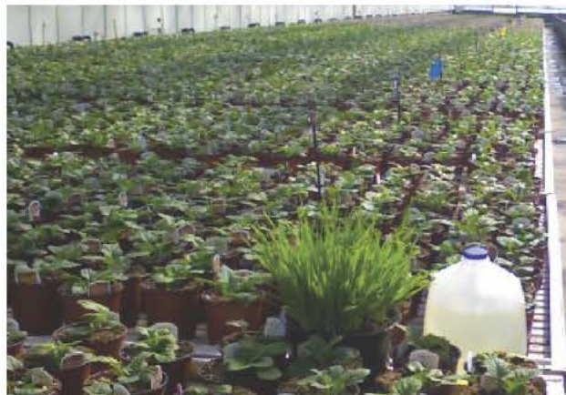
Fig. 1. Parasitoid ‘stinging’ an aphid to insert an egg that will develop into a new parasitoid feeding within the host (left) and a typical banker plant system at a commercial greenhouse in NC.