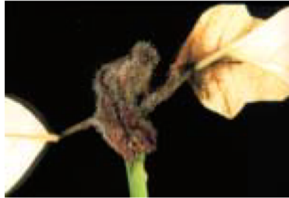
Dieback of poinsettia stem with sporulating disease.

Botrytis blight is a significant disease of poinsettias. It typically becomes established and reproduces on aging lower leaves that are near the moist soil surface and under the plant canopy. Botrytis readily infects the broken or cut stem surface of stock plants and progresses downward, causing a dieback of the entire stem. Spores are