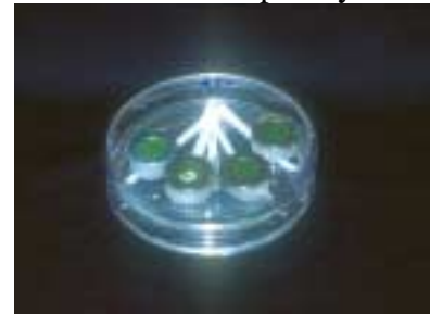
Chamber for studying sporulation.

Spore production. The effect of temperature on conidium (spore) production was measured using leaf disks held on agar disks in Petri dishes for 14 days at 59 or 68°F (15 or 20°C). Conidiophore numbers and spore chain length were counted microscopically.