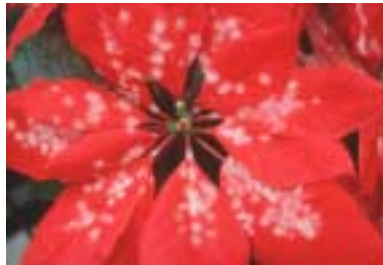
Powdery mildew on bracts.