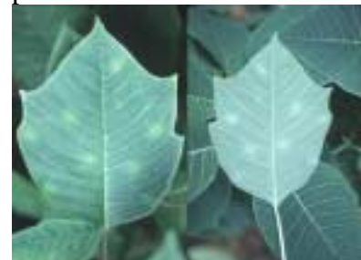
Pale spots on upper surface; white colonies on undersurface.

Symptoms of powdery mildew are often latent until fall, when greenhouse temperatures become lower than 86°F (30°C). Colonies on leaf undersurfaces may be hard to detect. Careful scouting and early detection are essential for precise management of powdery mildew on poinsettias.