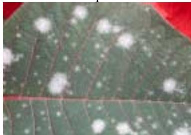
Closeup of mildew colonies on leaf.

Fungicides. Sixteen preventive fungicide treatments were compared on poinsettia 'Freedom Red.' Powdery mildew inoculum was introduced 48 hours after the first fungicide treatment on 14 October. Colonies were counted weekly on four previously-selected leaves and bracts of each plant.