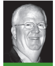
Dwight Larimer Design Master color tool, inc. Boulder, CO