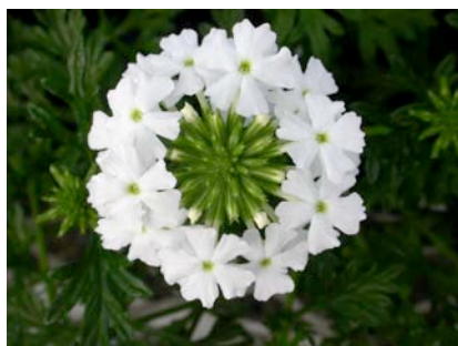
Fig. 1. Verbena cultivar Babylon White.