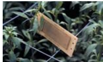
Leaf wetness sensor in commercial snapdragon field.

conidia were released into the air in the morning as the relative humidity decreased and the temperature increased.