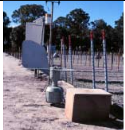
Burkard volumetric spore sampler in commercial snapdragon field.

Downy mildew conidia were detected in the air between 5:00 A.M. and 12:00 P.M. with the highest spore numbers occurring between 7:00 A.M. and 9:00 A.M. (see graphs on next page). Downy mildew