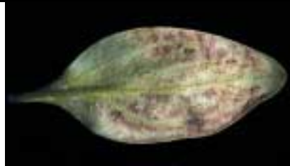
Downy mildew spores on underside of snapdragon leaf.