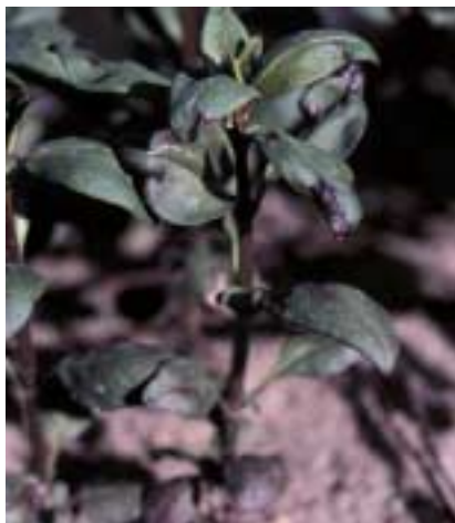
Snapdragon seedling infected with downy mildew.

Downy mildew of snapdragon is caused by the fungus, Peronospora antirrhini . Depending on the climate and weather, crop losses caused by this disease can vary greatly between years and seasons. The disease causes spotting, cupping and distortion of foliage, shortening of internodes, and terminal bud death of seedlings which results in multiple flower stalks. Knowing how the environment affects downy mildew may help cut flower growers recognize when the weather favors disease development