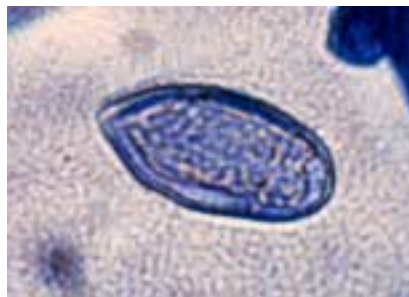
Conidium of the downy mildew pathogen.

The concentration of downy mildew conidia (spores) in the air over a commercial snapdragon field in Florida was monitored over three growing seasons using a Burkard volumetric spore sampler. Temperature, rainfall, relative humidity, and the duration that leaves were wet were also monitored.