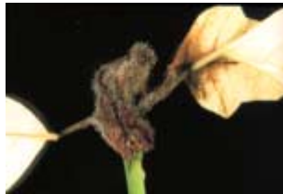
Dieback of poinsettia stem with sporulating disease.

Botrytis blight is a significant disease of poinsettias. It typically becomes established and reproduces on aging lower leaves that are near the moist soil surface and under the plant canopy. Botrytis readily infects the broken or cut stem surface of stock plants and progresses downward, causing a dieback of the entire stem. Spores are