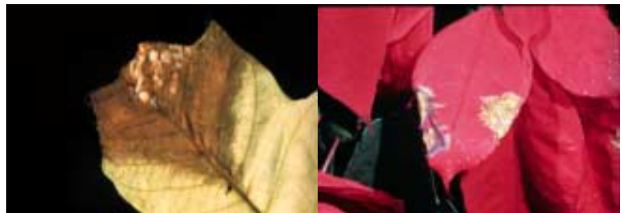
Botrytis blight on white and red bracts of poinsettia.

Several fungicides showed activity against Botrytis . Daconil Weatherstik