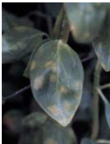
Downy mildew on field-grown snapdragon.