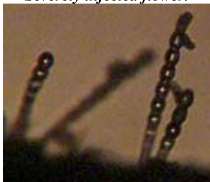
Powdery mildew conidia.