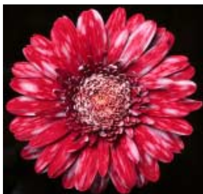
Severely infected flower.

Powdery mildew is a fungal disease of gerbera caused by Erysiphe cichoracearum . This pathogen infects many plants, including annual and perennial flowers, and vegetables. It can occur on all aerial plant parts including the flowers. Severe infections can cause death.